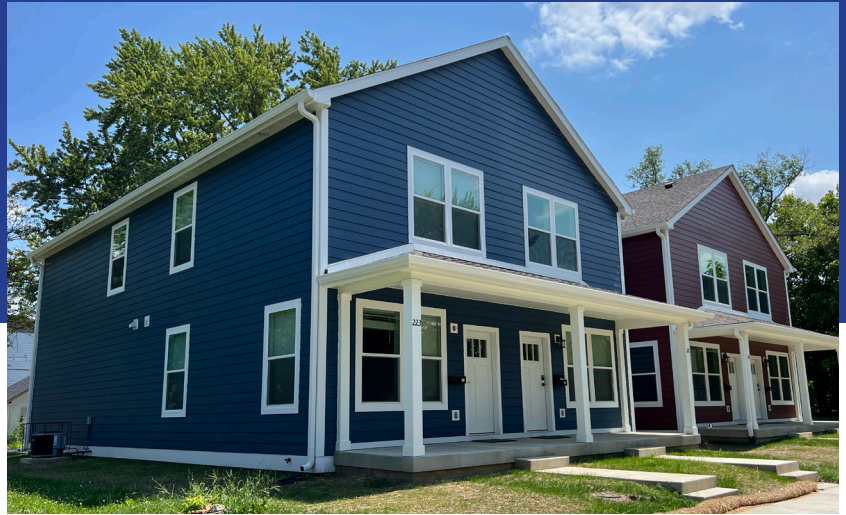
Jasmine Duplexes at 216 N. Temple Ave, Indianapolis, IN 46201

Dimensions: 31'-1" x 56'-0" Square Feet: 1736/Unit, 3274 Total Stories: 2 Bedrooms: 3 Bathrooms: 3 Total Modules: 4 Price: Sales@Volumod.com for pricing